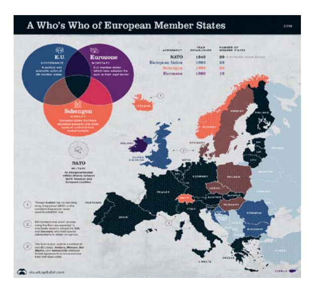
Fig 4. Schengen and Eurozone members from the EU and NATO States.

the eastern flank have increased their defense expenditures as requested by the NATO Summit in Wales 2014, while building more capabilities for the NATO Defense Planning Process. This has happened starting with the year 2014, following the Crimean Crisis, due to the fact that countries like Romania, Poland, Estonia, Lituania, Latvia have a different assessment of risk and threats due to their geographic position, compared to the western member states.