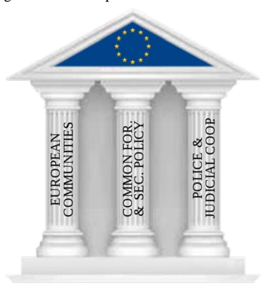
Fig. 1 The Three Pillars of the EU

it clear the European Union would also need to strenthen its foreign policy. The Maastricht Treaty brought in three new pillars.